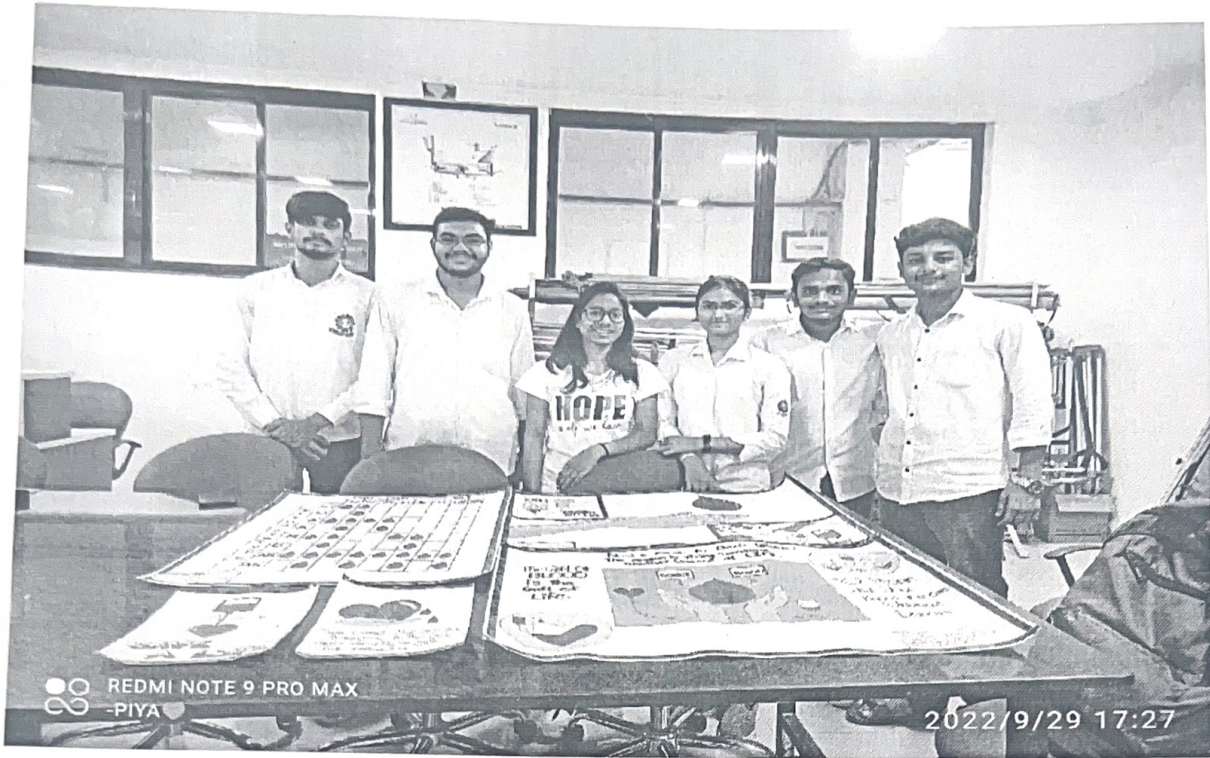
.Poster Presentation Volunteers