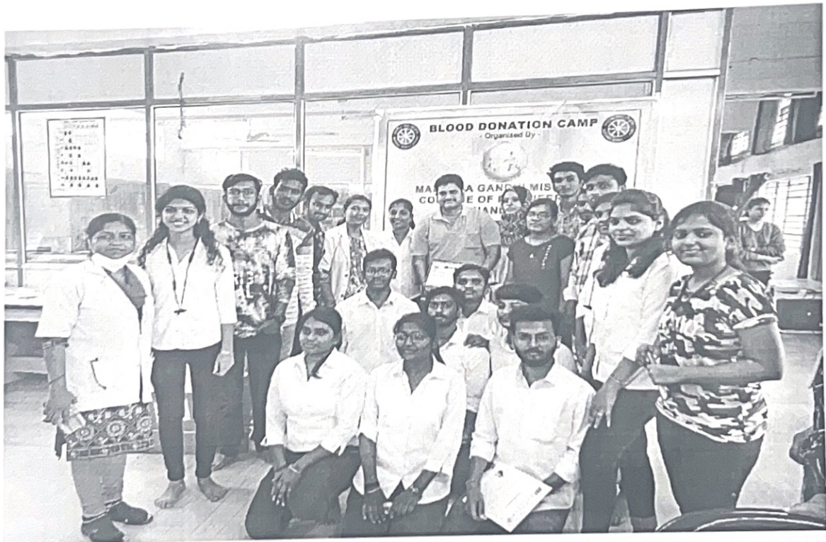
NSS Coordinator with NSS Volunteers